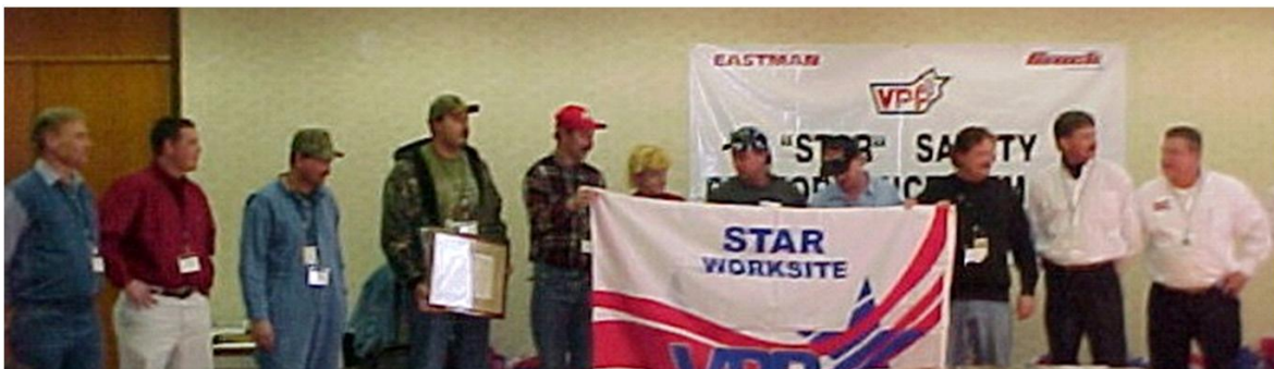
Brock Service Painting Company's VPP Team Members hold Department of Labor OSHA STAR Flag & Plaque.